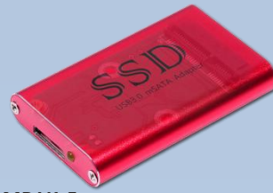
SSDMB V1.5 (mini-SATA to USB3.0 Adapter) X1