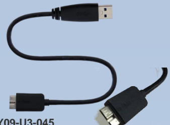
Y09-U3-045 (USB 3.0 A Male to Micro B Male 45cm Cable) x1