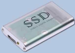
SSDMB V1.5 (mini-SATA to USB3.0 Adapter) X1